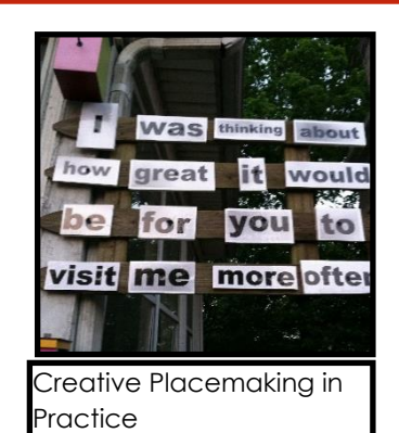
NJIT HUB Challenges Students to a Competition